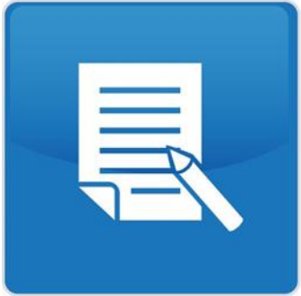
Round 1 Application