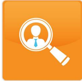
Round 2 EQ Test