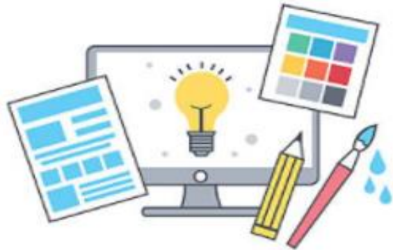
Digital & Marketing