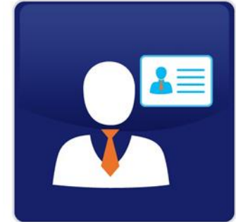
Round 4 Face to face interview